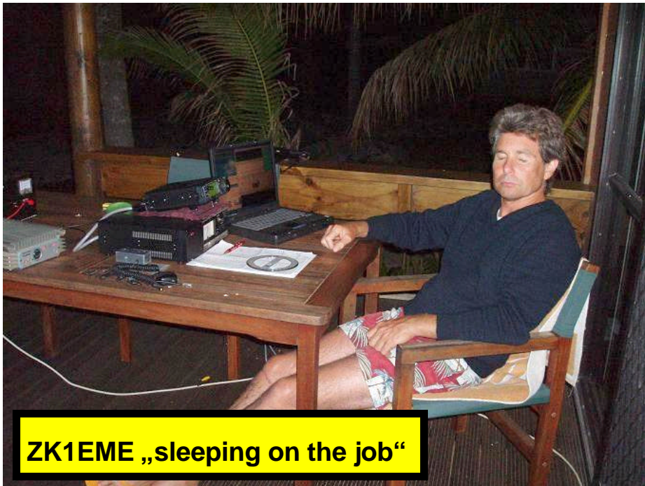
ZK1EME „sleeping on the job“

N5BLZ (-21), RK3FG (-23), HB9Q (-24), RA3AQ (-26), EA6VQ (-20), OE5MPL (-24), ON4IQ (-27), RX1AS (-18).