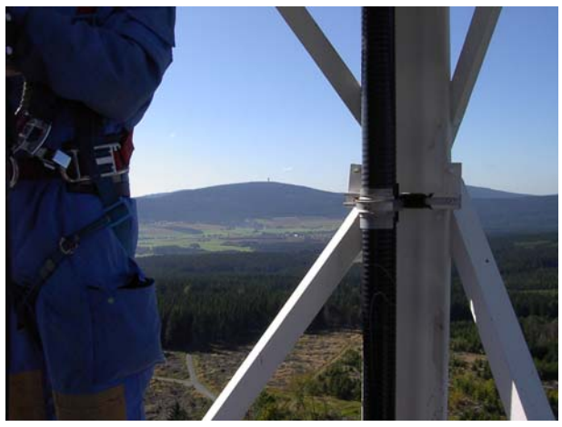
In the background the place from DB0FGB