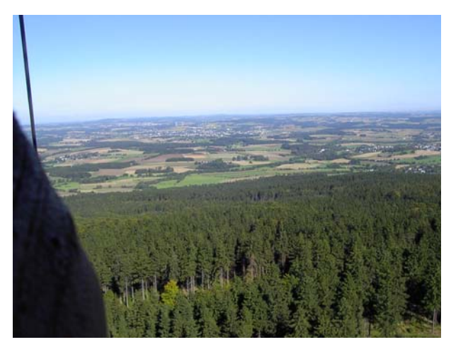
A view from the place of the antennas