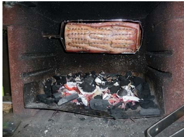
The first step is to start the stove and bring the meat at the right position!