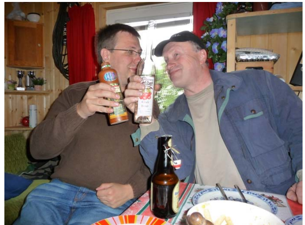
First place 70cm meets 1st place 3cm!!