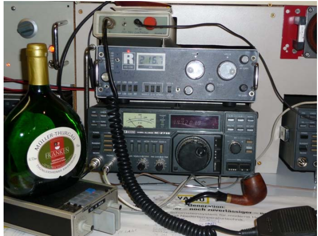
The driving Transceivers for 23cm and 13cm during this contest are an old IC271 and my good old R2CW. (I still like this radio very much)