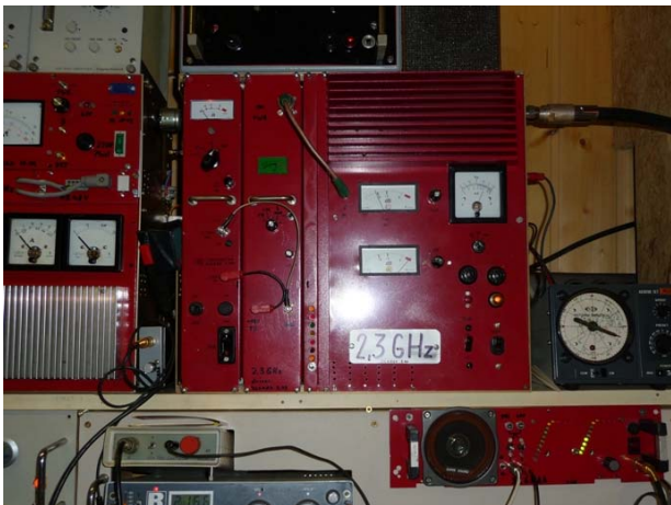
Most components of my station I build many years ago