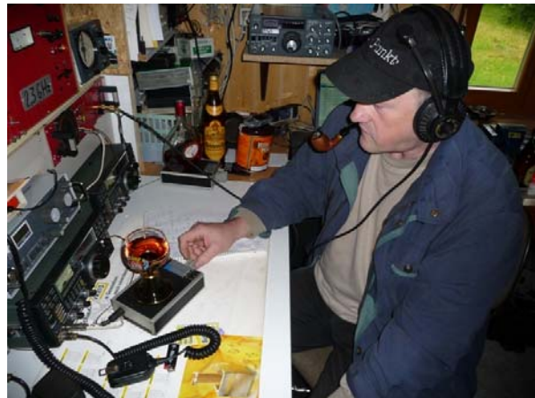
On Saturday I supported my friends with points on 13cm. Only few QSO I made on 23cm because it makes no fun to work on that band if there is a RADAR- station at the neighbourhood.