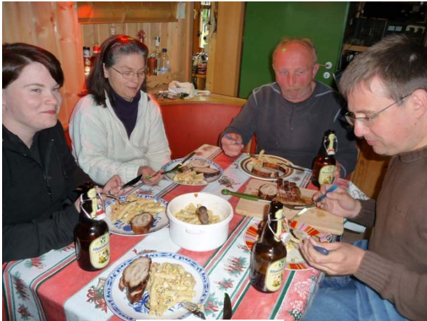
Time for dinner