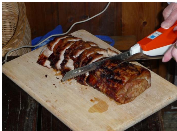
Not only at home my wife is the "chief of the kitchen"!