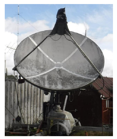
G4RFR dish used on 3 and 9 cm

<u>G4RFR</u> : Julian (G3YGF) <u>Julian@ygf.org.uk</u> reports on the FRARS club's recent Moon activity -- It has been a poor month for Moon windows, but on 23 Nov we had two more QSOs on 3.4 GHz with PA3DZL (10DB/22DB) and OK1KIR (6DB/18DB). At the time our TX was acting up and we couldn't hear any echoes. We hoped we had it fixed and were QRV again on Wednesday 20 Dec, first on 10 GHz with 200 W and then later on 3.4 GHz with 40 W. All was OK on 3 cm, but 9 cm had problems and no QSOs were made.