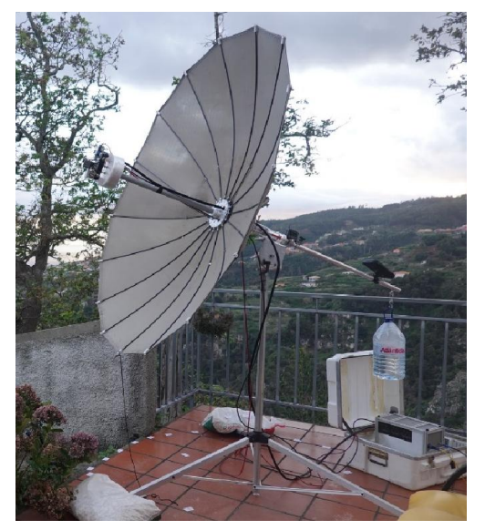
CT9/EA8DBM 1.8 m folding dish on Madeira island

DXPEDITIONS: There is very little to report. N1V and W2HRO are preparing to return to Hi on 10-16 March with operation on 902, 1296, 2304 and 10 GHz. Continuing operation by PJ4MM from Bonaire on 432 and PJ2BR from Curacao on 1296 is expected. The 4W8X dxpedition to Timor-Leste was successful on both 23 and over a more limited period on 70 cm. Reports indicate a good number of contest QSOs. A post dxpedition report has not yet been received. The CT9/EA8DBM dxpedition on Madeira island was also successful with a good number of QSOs made. See the report in this NL.