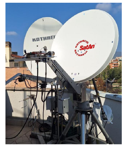
EA3HMJ's 3 cm Portable EME Demo Station

EA4URG: Iban (EB3FRN) <u>icardona@gmail.com</u> sends news of an EA 10 GHz EME Demonstration Event that is looking for skeds -- On 16 and 17 of Feb in Guadarrama there will be an EA and CT Microwave Meeting. This year EA3HMJ will put on the air a portable 3 cm EME station using a 90 cm dish and 40 W with very good tracking. The station will use the callsign EA4URG and make a special QSL for the event. Please send to <u>ea3hmj@gmail.com</u> requests for skeds. We will also be on HB9Q during the event.