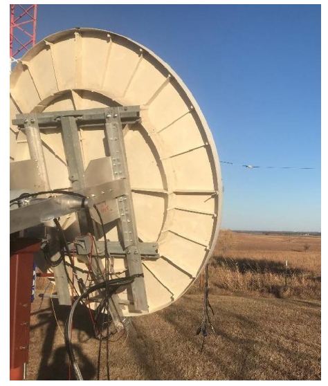
Shot east from N0OY 1.8 m dish used on 3 cm

NOOY: Pete <u>petesias@yahoo.com</u> is now fully QRV on 3 cm EME with a 1.8 m offset dish permanently mounted at my hilltop location in EM18ct, KS -- My mount was designed to allow for 0 deg elevation to be workable for terrestrial contacts. I am running 30 W and a 0.6 dB NF LNA. Since my first initial contact with W5LUA, I have had QSOs with OZ1LPR, GI7UGV, UR3VKC, F6BKB, CX2SC, F5VKO, LZ4OC, IZ4BFA, IK0HWJ, IW2FRZ and K2UYH. I am also QRV on 23 cm CW and digital with my 28' dish.