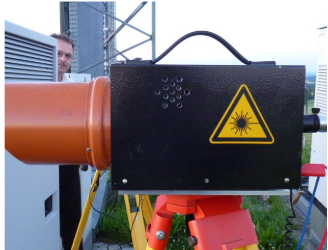
Abbildung 2: DB6NT in background