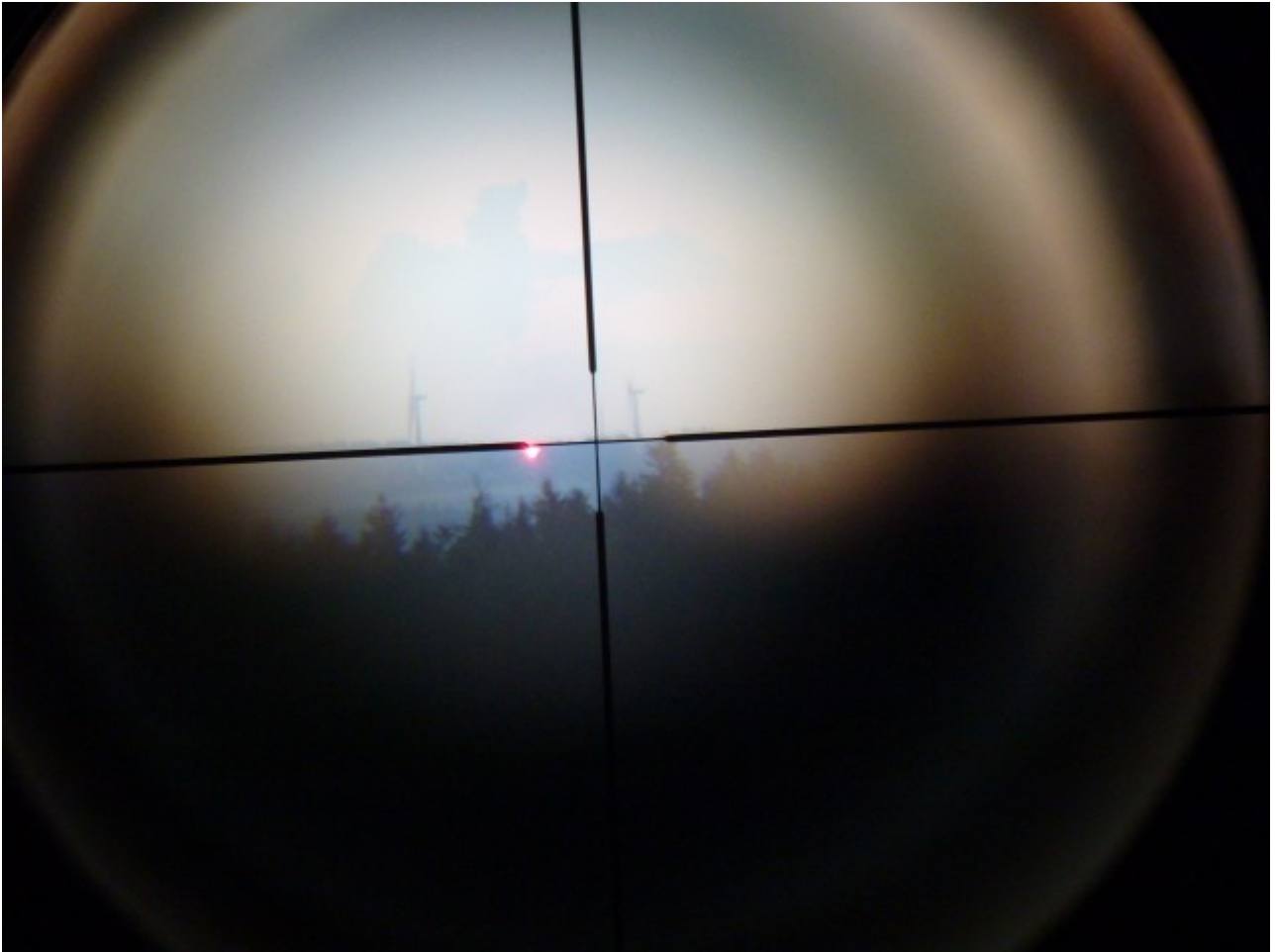
Abbildung 7: the target-finder from the transceiver is directed to JO50TI