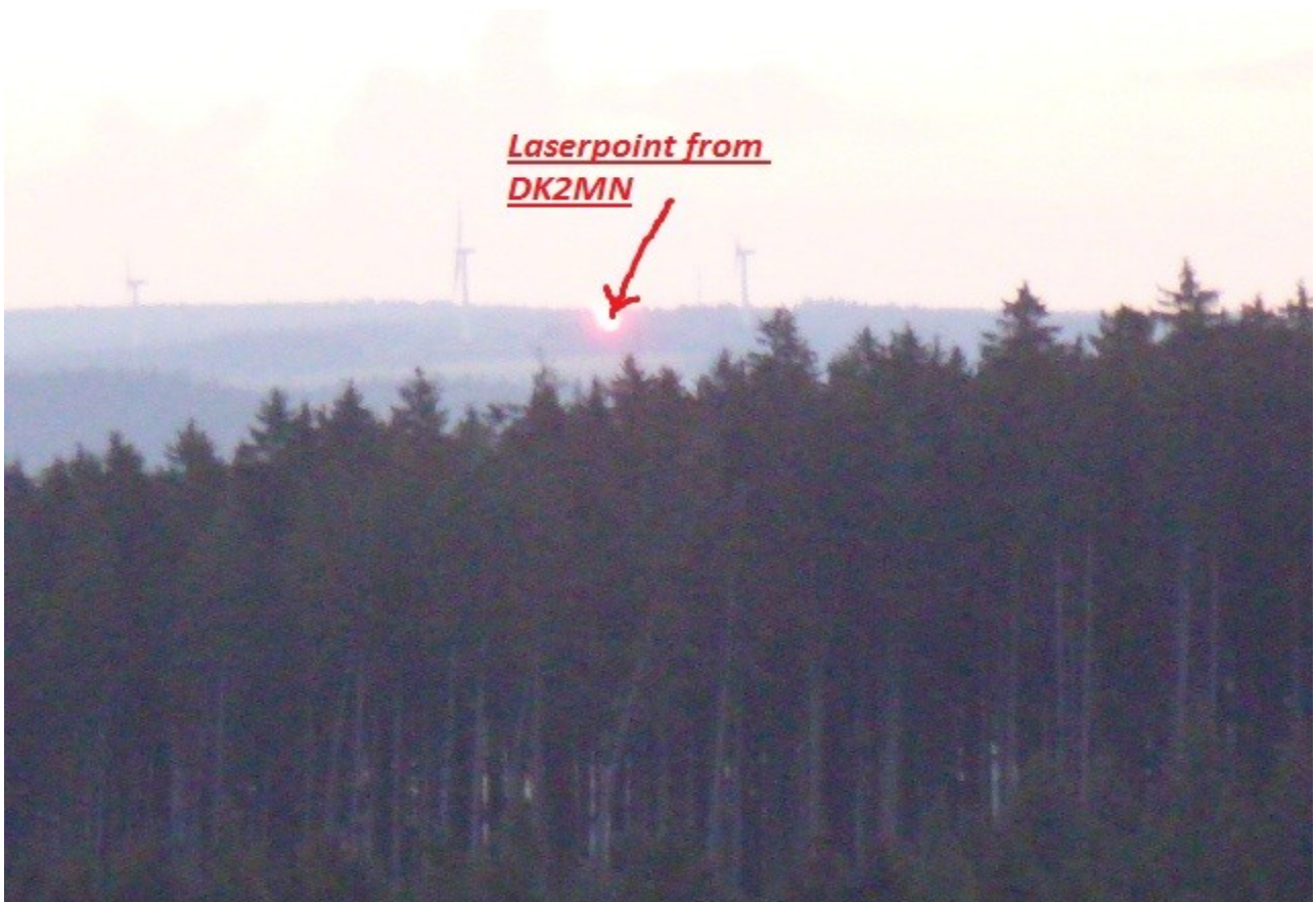
Abbildung 6: direction JO50TI with the zoom from the camera

For antenna- adjustment, DK2MN switched the Laser- diode on, I was very surprised about the brightness