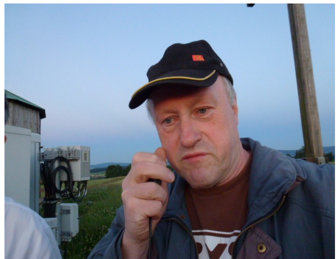
Abbildung 9: thanks Michael, you made the picture at the finest moment