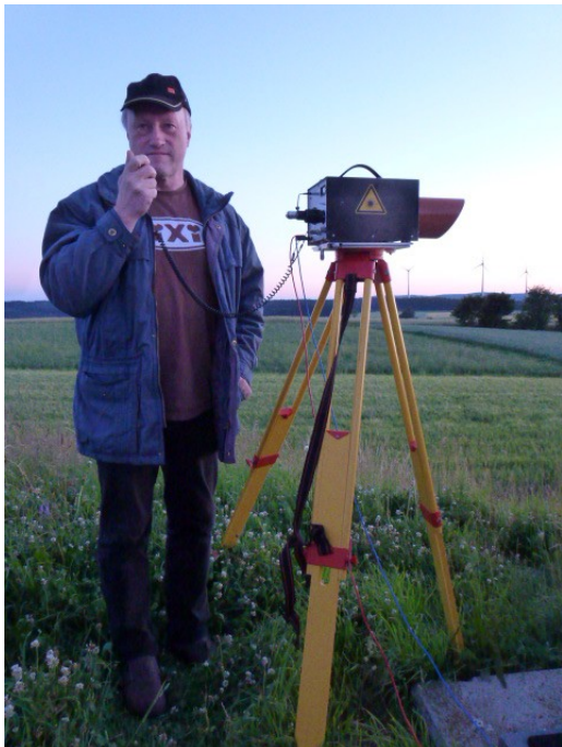
Abbildung 8: 59 001 from JO50VF