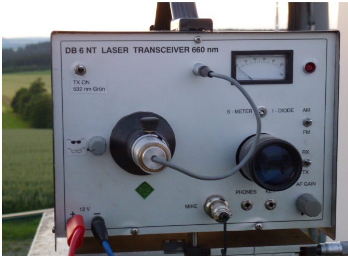
Abbildung 3: complete transverter