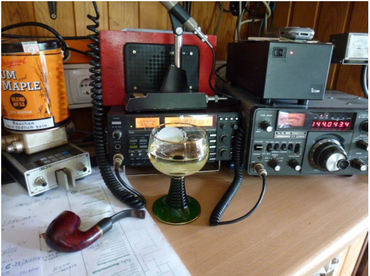
Abbildung 11: .....most important details