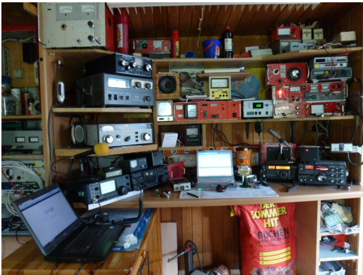
Abbildung 10: Contest- setup at my 3cm station