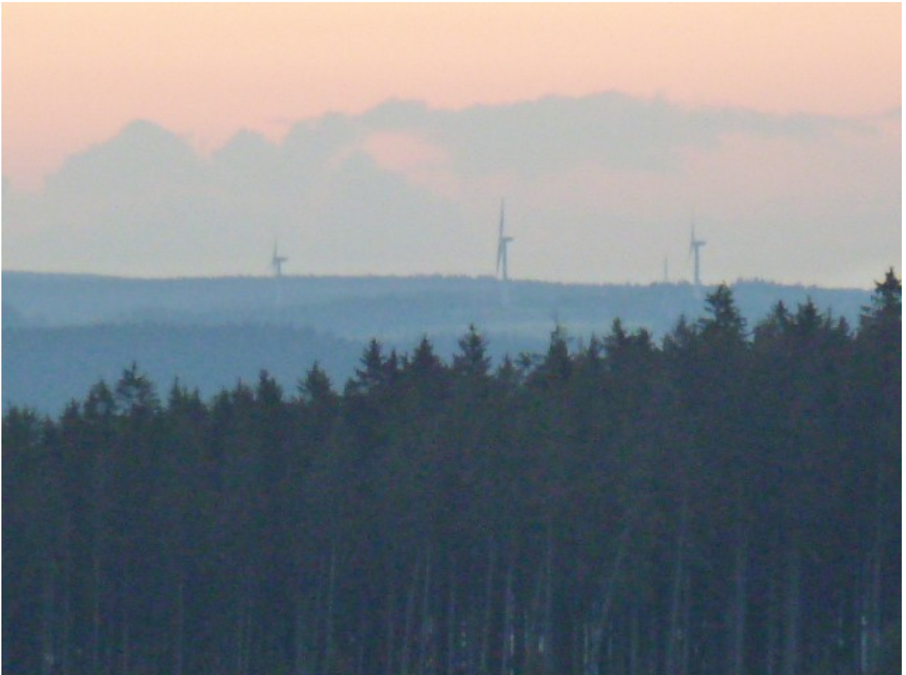
Abbildung 4: view from JO50VF to JO50TI

Fortunately we had a beautiful evening and a beautiful sunset too, so I was able to see the wind generators in the neighbourhood from DK0NA, and even the antenna tower for a commercial radio-system, with the zoom from my photo-camera, a little LUMIX TMC- TZ22 with its 20 times enlargement.