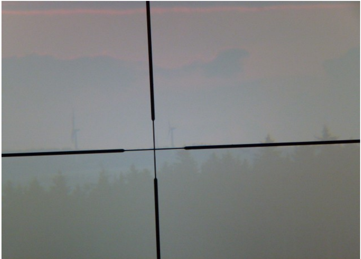
Abbildung 5: same view through the target- finder from the transverter