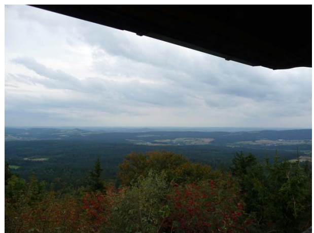
To south direction there is an absolute clear horizon.