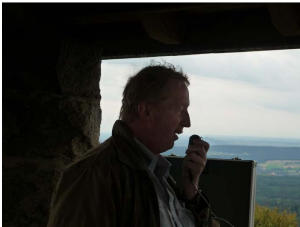
DG8EB in QSO with DL6NCI