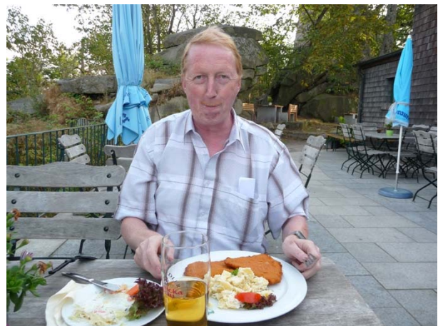
DL6NAA and DG8EB