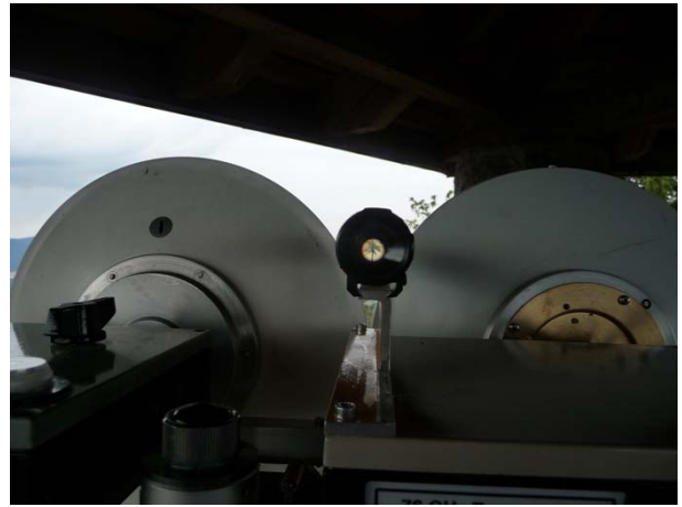
A great help to find the right direction