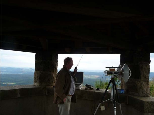
Cross talking on 70cm to DB6NT in JO50TI