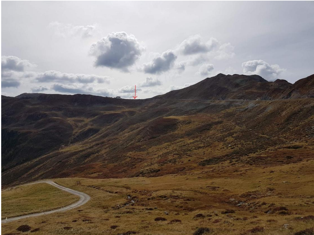
View in some directions