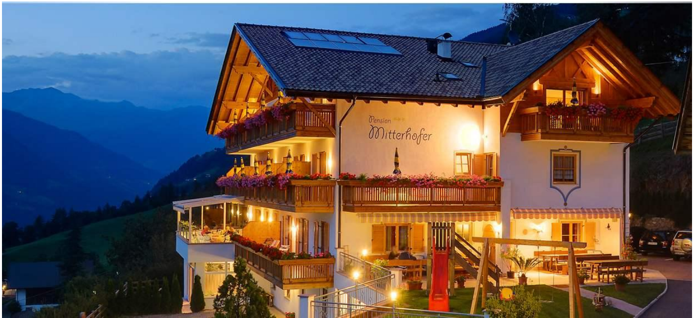
View direction north

It was a long trip to South Tirol (Alto Adige) so I decided to go to our hotel (JN56OR 850m asl). The hotel is located in Verdins (Schenna) close to the city of Meran.