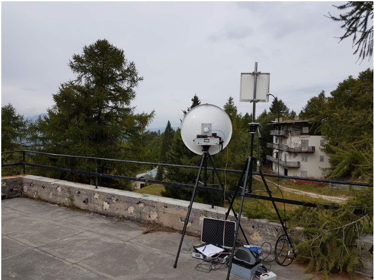
Some QSOs via AS (13cm - 3cm). View dir DL.