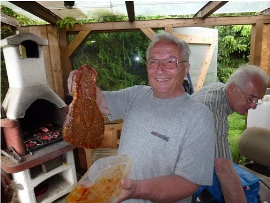
Abbildung 11: DK5NI celebrates the new rotator with a small steak...