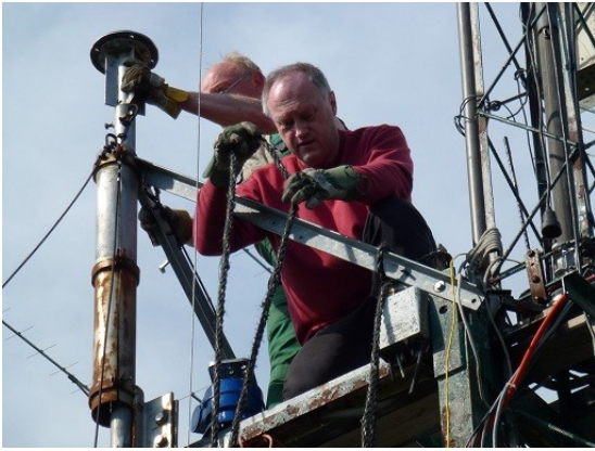
Abbildung 4: DL6NAA on top of the tower