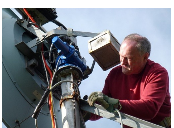
Abbildung 7: DL6NAA is fixing the cables