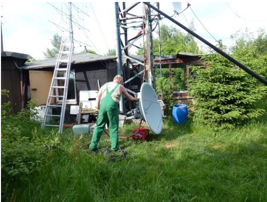
Abbildung 5: the complete 3cm system ready to lift