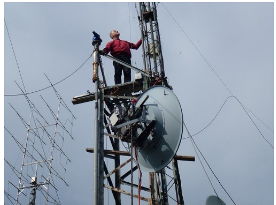
Abbildung 6: a simple crane lifts the 250Kg easy...