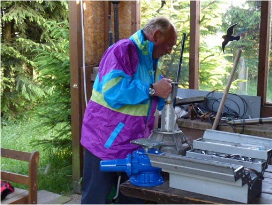
Abbildung 1: DJ2NR is doing a hard job

As we had some problems with the indicator from our old system we decided to replace the old rotator to a new one. Below there are some pictures from our job.