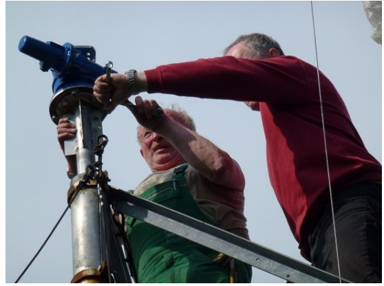
Abbildung 3: ...fixing the new rotator