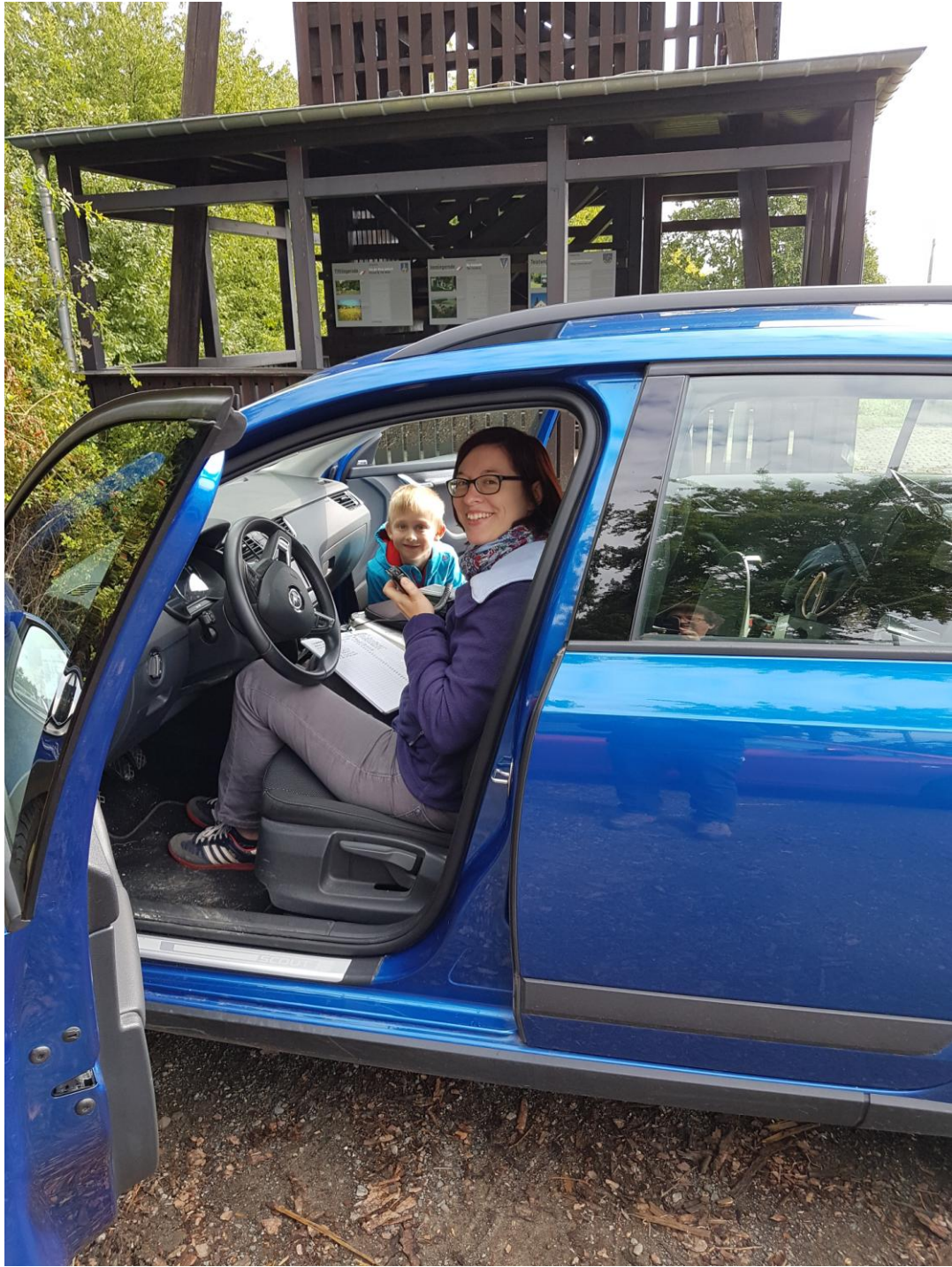
mountain Pferdeberg in JO51CL (255m asl)