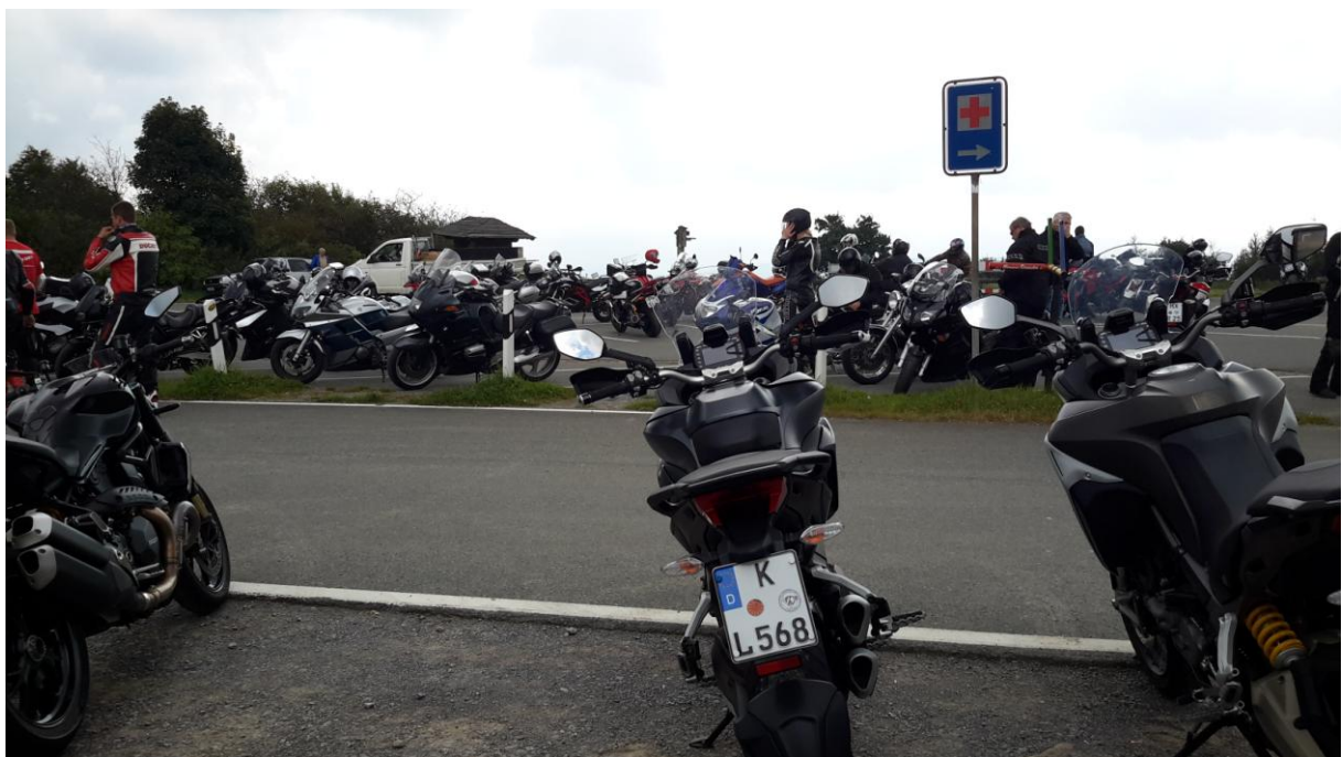
Mountain Koeterberg is a favorite meetingplace for the biker scene