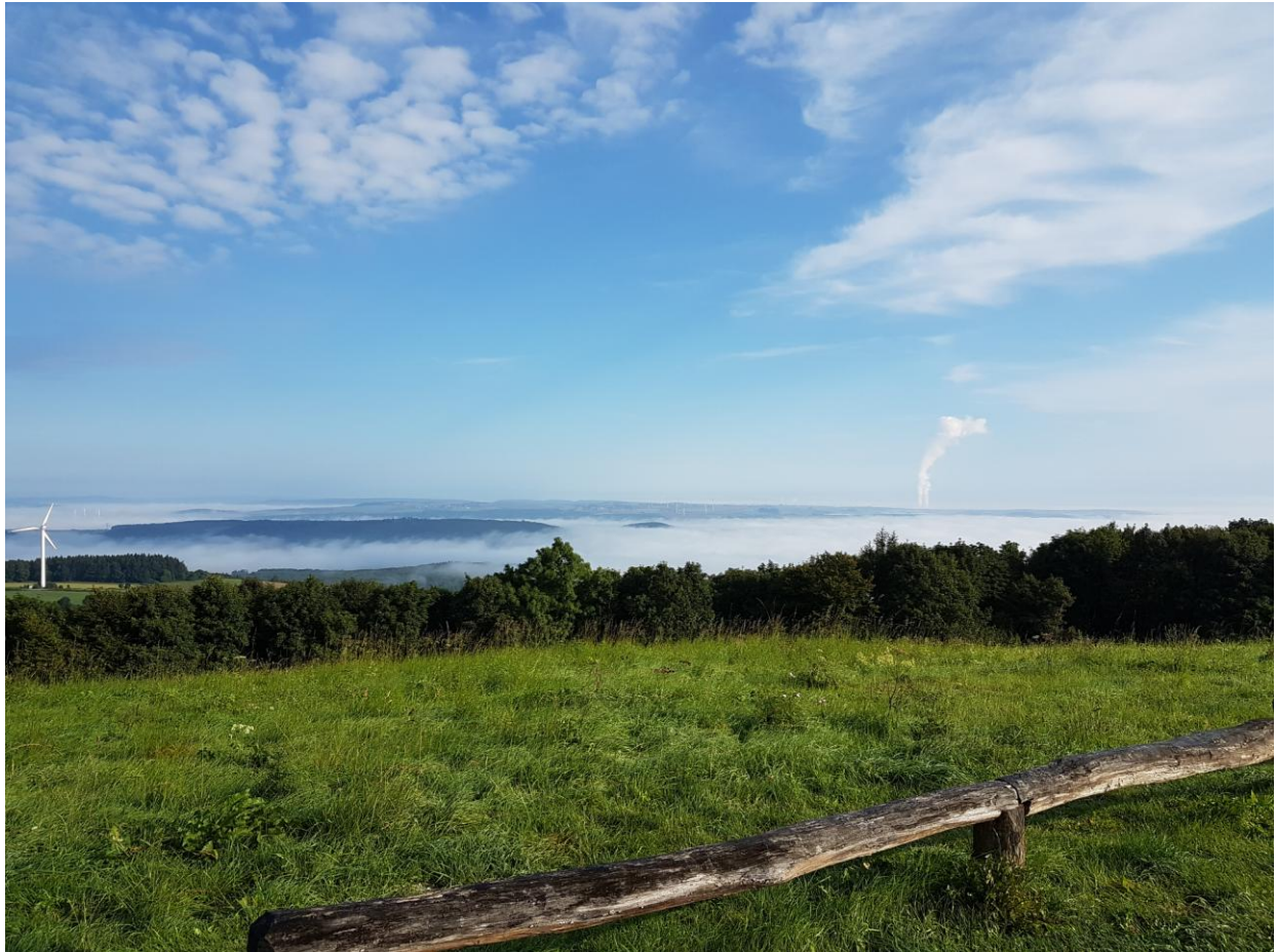
next morning- fog down in the valleys – view dir north