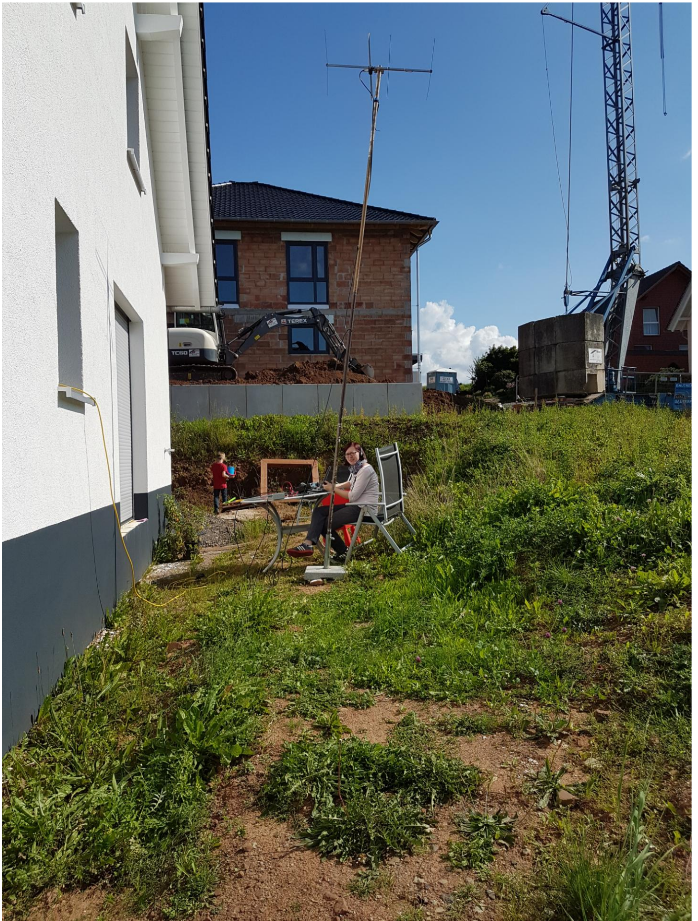
some test on 2m from her home QTH (also JO51CL)