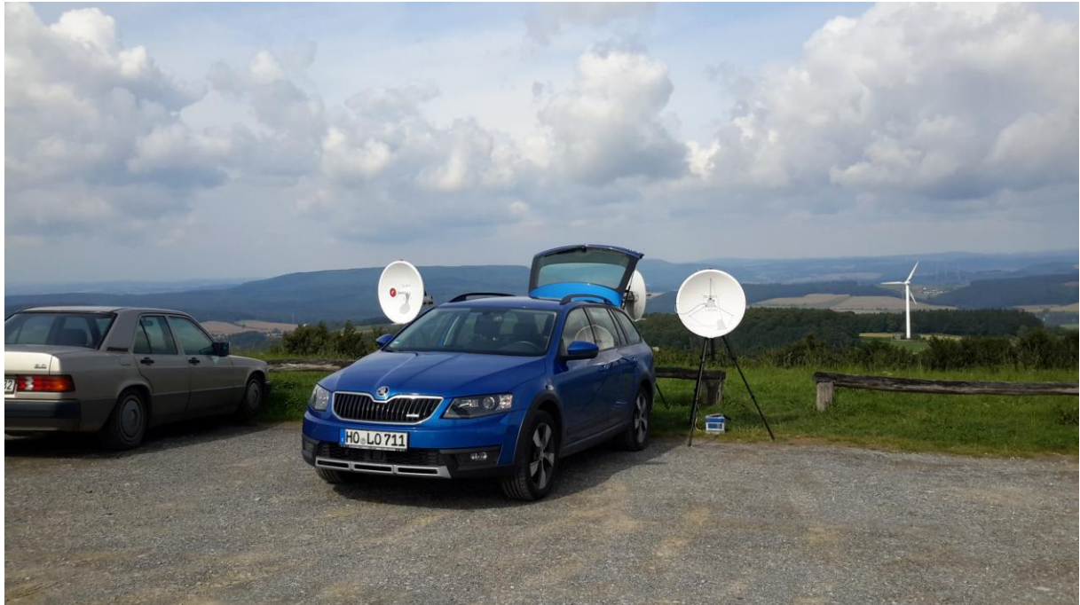
View direction north