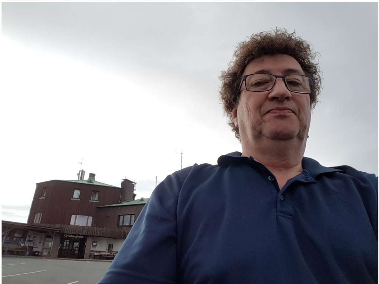
Hotel mountain Koeterberg