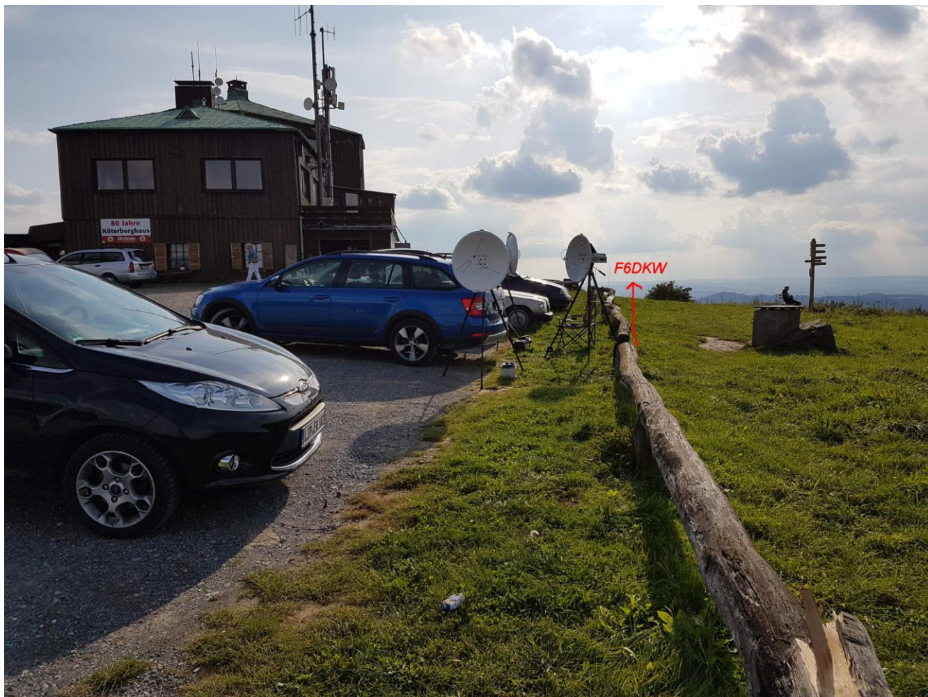
10GHz AS QSO with Maurice F6DKW JN18CS