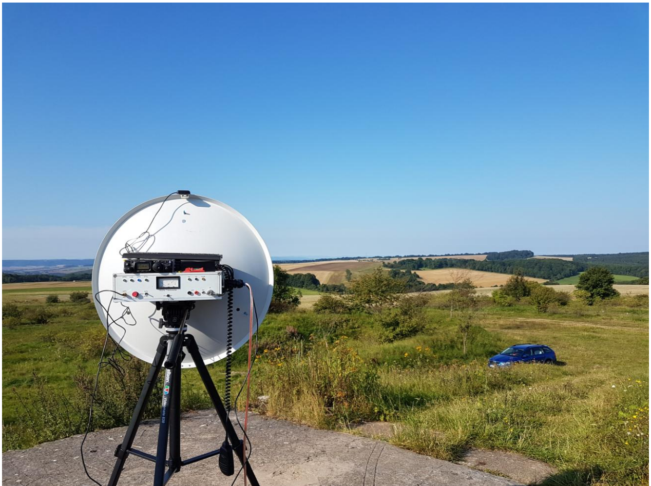
again very nice AS QSO on 3cm with Maurice F6DKW (655km)