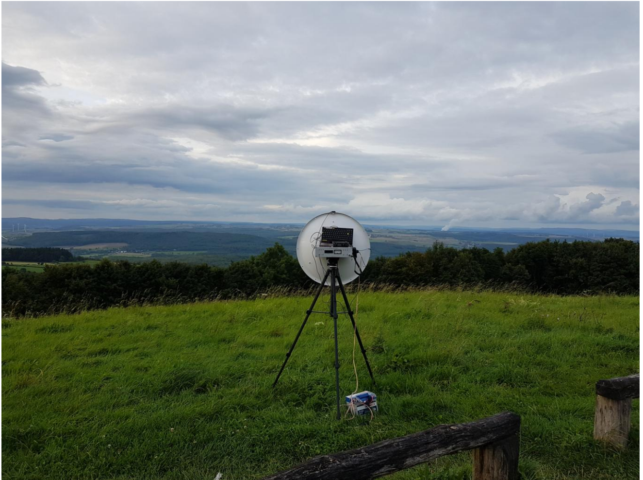
9cm qso with Peter OZ9PP – sunset in jo41pu