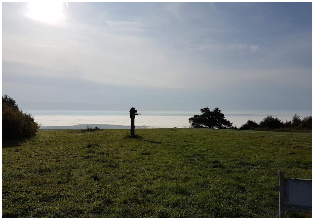
View dir south