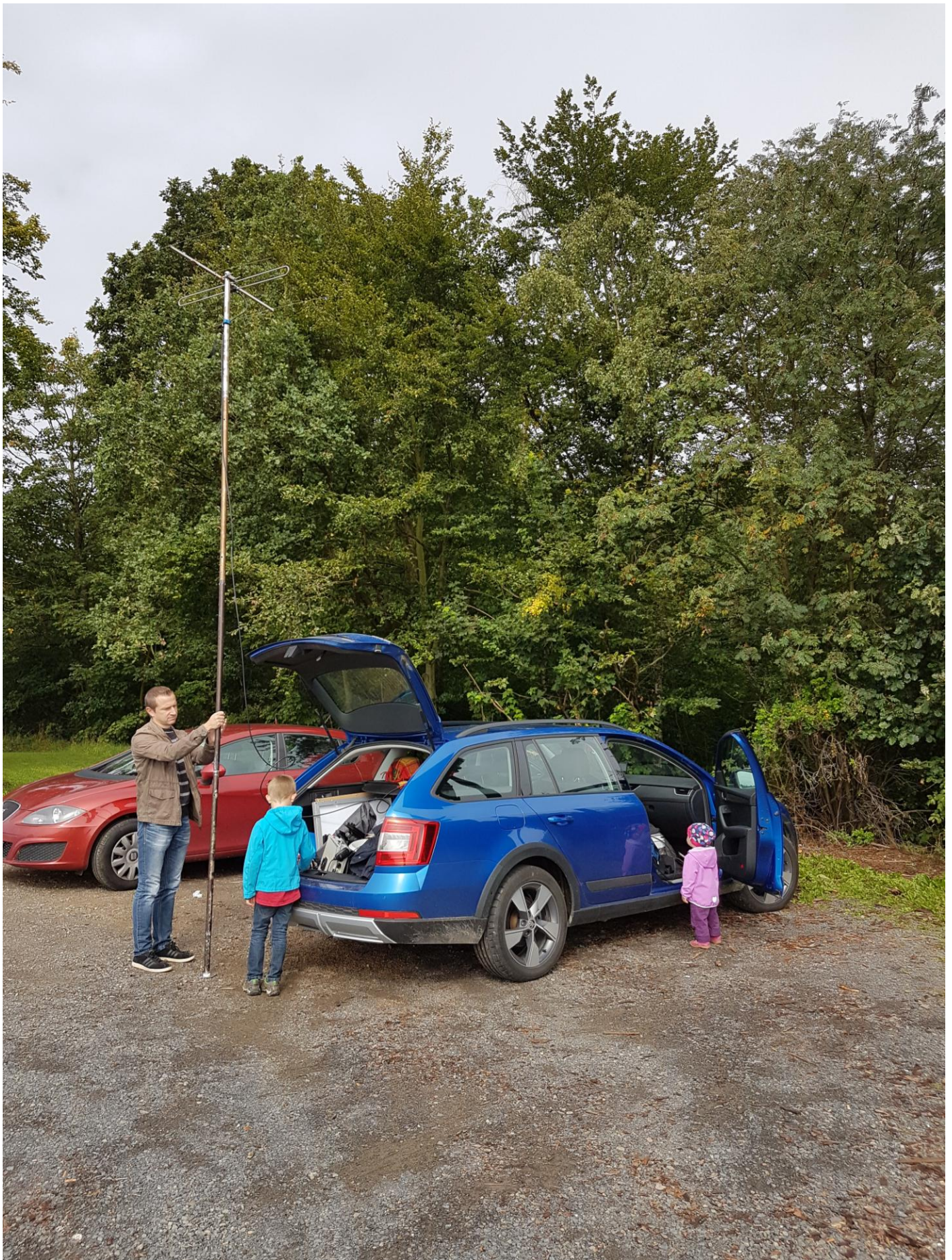
Complete family was included to fix the mast for the 2m antenna