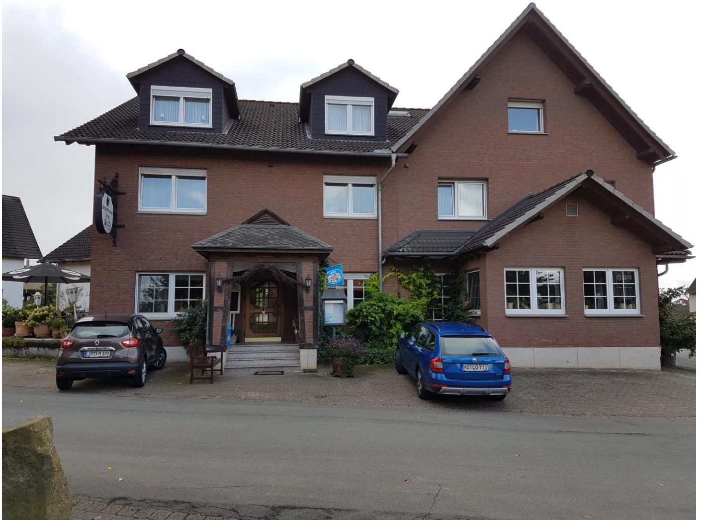
Hotel "Schierbrucher Krug" 8kms from Koeterberg

I have made some QSOs during IARU R1 144MHz contest with 50watts and 4 element Yagi (odx G8P in JO01)