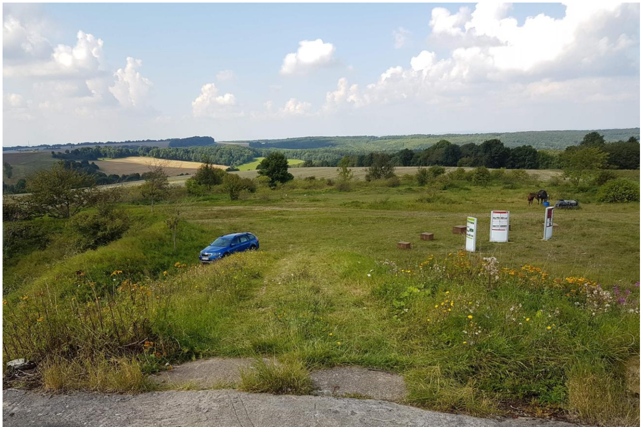
Birkenberg is a lonely place in the nature, only some horses in the neighborhood