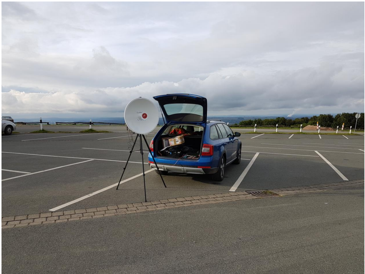
3/6cm qsos to DL3IAE/DL3IAS