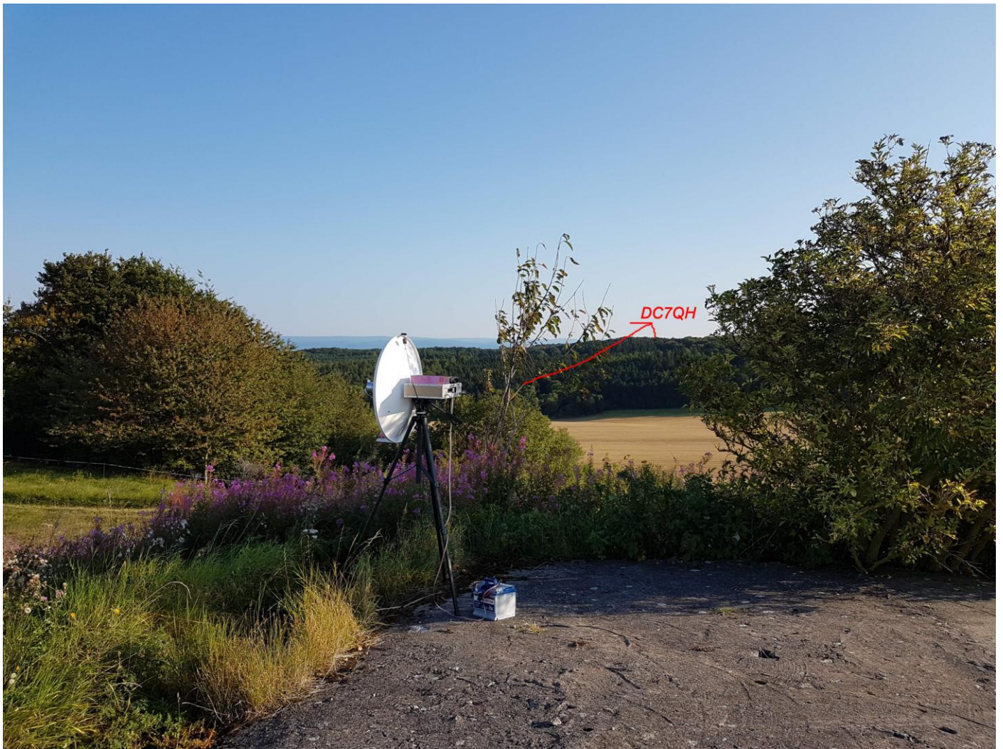
platform for the former radar antenna – view direction Berlin