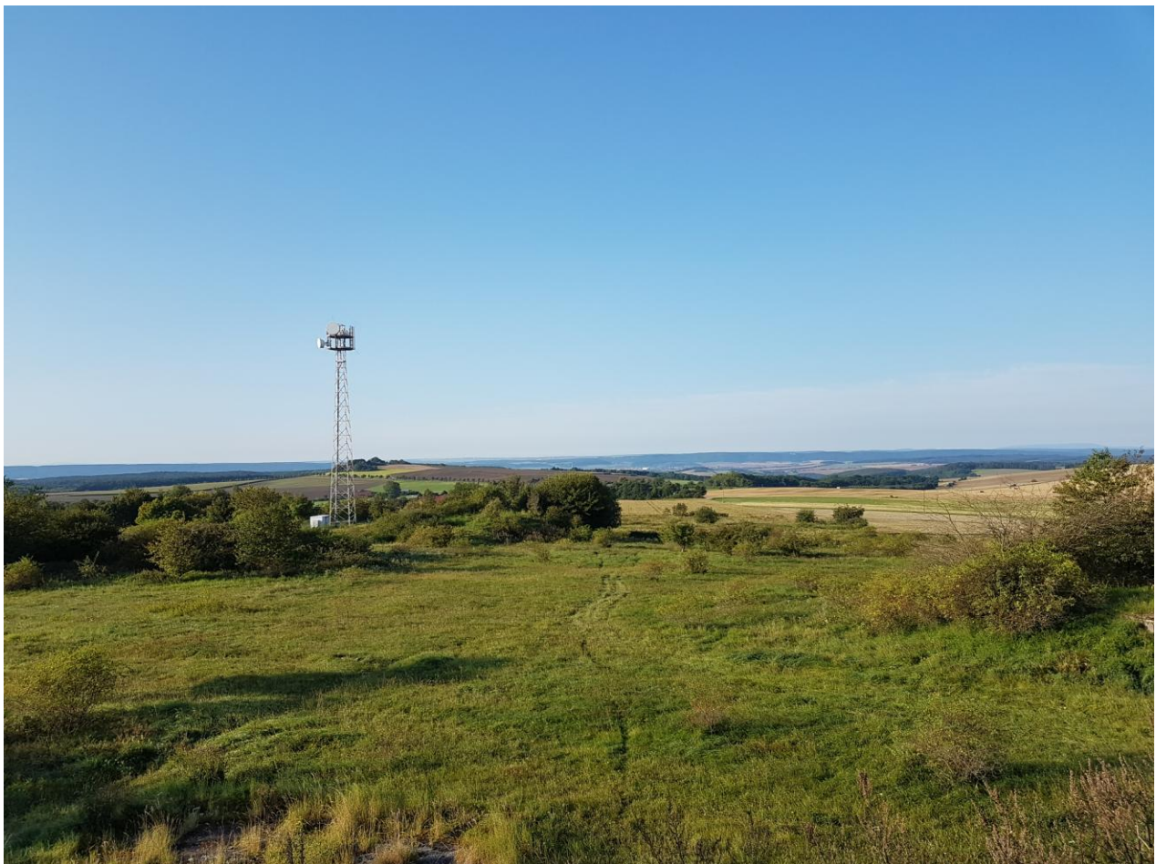
view direction south