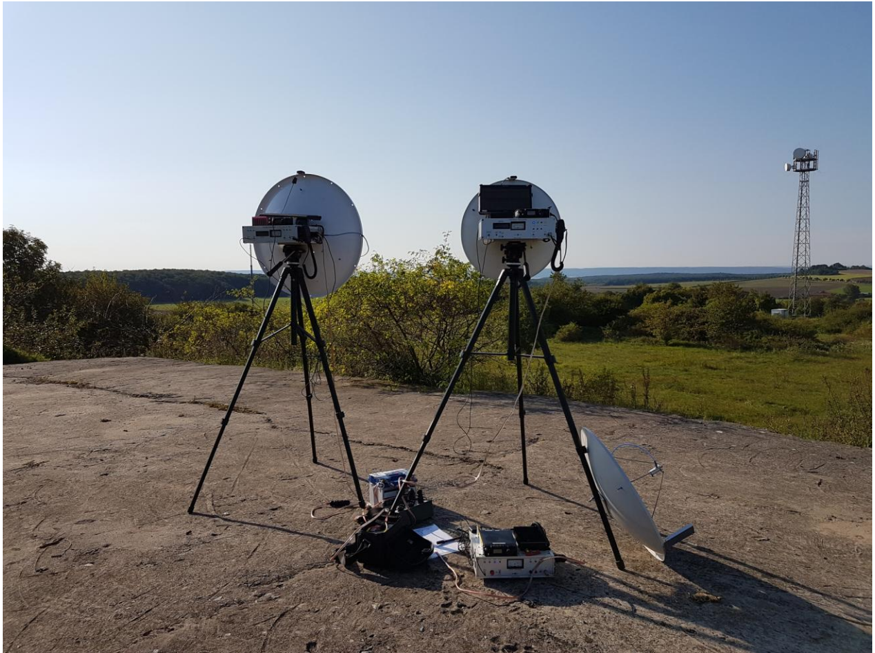
direction DL7QY for some tests on 24GHz