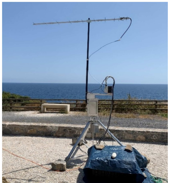
SV9/HB9CRQ 11 el yagi used on 432 EME

summary follows, but Dan has promised to send pictures and more details for the next NL. On 70 cm they used JT6B to make 8 QSOs and 8 initials in 7 DXCCs; on 23 cm they used JT65C and CW to make 104 QSOs and 85 initials, 7 were on CW in 24 DXCCs; on 13 cm they used JT65C and CW to make 19 QSOs and 14 initials, 5 were on CW in 10 DXCCs; on 9 cm they used JT65C and CW to make 15 QSOs and 10 initials, 5 were on CW, in 8 DXCCs; on 6 cm they used QRA64D to make 20 QSOs and 15 initials, 7 were on CW in 12 DXCCs; and on 3 cm they used QRA64D and CW to make 28 QSOs and 22 initials, 9 were on CW in 13 DXCCs; for a total on 194 QSOs and 154 initials, 33 were on CW in 30 DXCCs. Please send your QSLs with an SAE to HB9Q, P.O. Box 133, CH-5737 Menziken. They will be on again from A21EME in Oct.