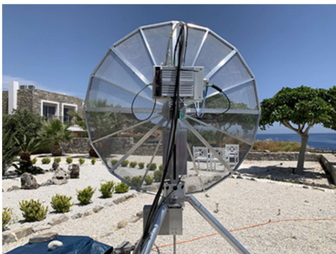
SV9/HB9CRQ's 1.5 m dish at Crete dxpedition site

Troubling news from Denmark: In OZ amateur use of the 13 cm 2304 and 2320 sub-bands were on 1 Jan. They still have access to the 2400. As of 1 July use of the 3400 band will be lost.