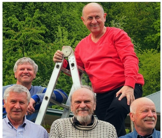
UK2BAS team 1979

The operators recently met after 40 years to reminisce and discuss new challenges.