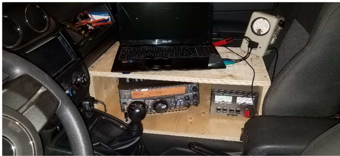
VA3ELE dxpedition operating position

VE2TWO: Peter (VA3ELE) va3ele(x)gmail.com (and VE2UG) report on this summer's Zone 2 EME dxpedition – We are disappointed to inform everyone that the Zone 2 expedition will only be on 432 (from a new grid FO60tf) and 1296. There is a chance we will also be QRV on 13 cm, but the system has not yet been tested. We have lost one of the members of our team, which has forced us to rollback our plans for the microwave EME. Perhaps we can try to include them next year. The dxpedition is from 28 June to 8 July at Sept Iles, Quebec, Canada. See Facebook at https://www.facebook.com/groups/998896550301418/ .