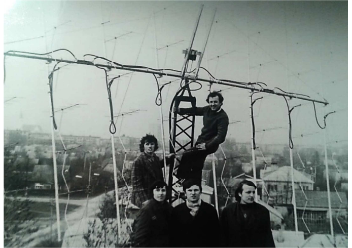
UK2BAS team 1979