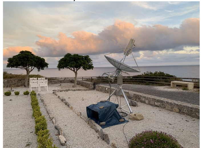
SV9/HB9CRQ on 1296 EME

► If you are QRV on 6 cm and/or 9 cm don't missed the Dubus weekends. We both plan to be QRV on EME. 73, AI - K2UYH and Matej – OK1TEH