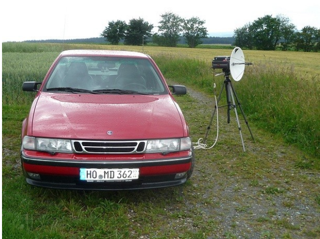
Temporary set up for first station check