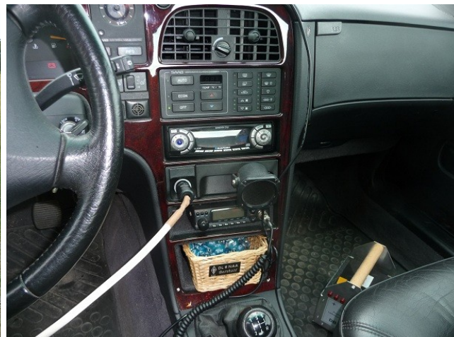
The power comes from my car...