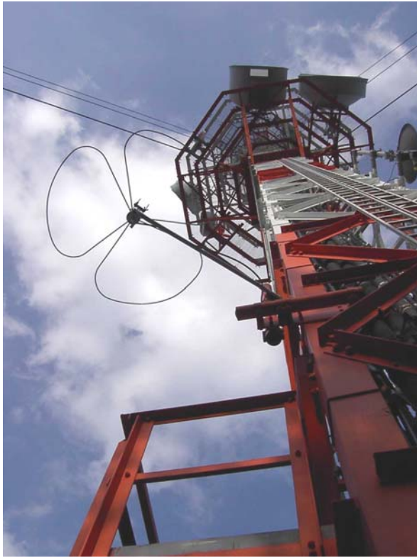
Big wheel for 144MHz