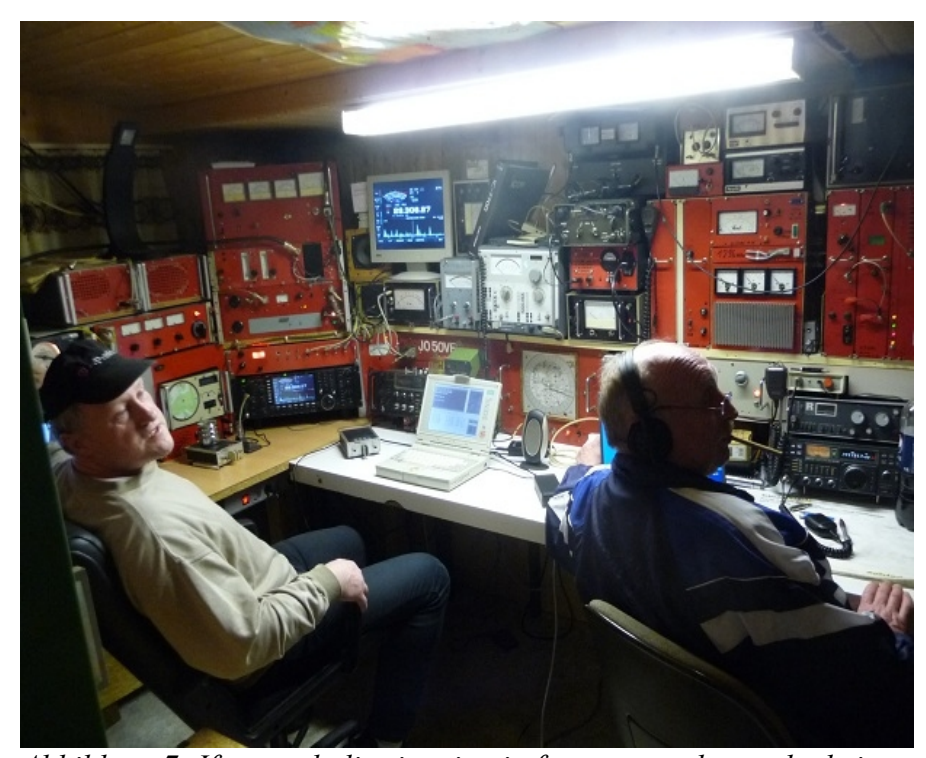
Abbildung 7: If young ladies jogging in front ou our hut, nobody is interested contesting!

As usual my short report about the activity from Ahornberg mountain, no one from us had energy to win the contest. See you in May!