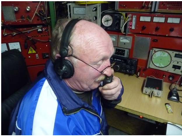
Abbildung 4: CQ-contest on 2m

If there was a request I went to the 3cm room and tried to make a QSO. I think the condx on that band were below normal, only 3 contacts over 400Km are in my log. The ODX was ON4SHF/R, QRB 500Km, during try with ON7BV/p and DH8AG we only could hear each other but no QSO could be completed. Perhaps if we tried it more often we could be able to do it?