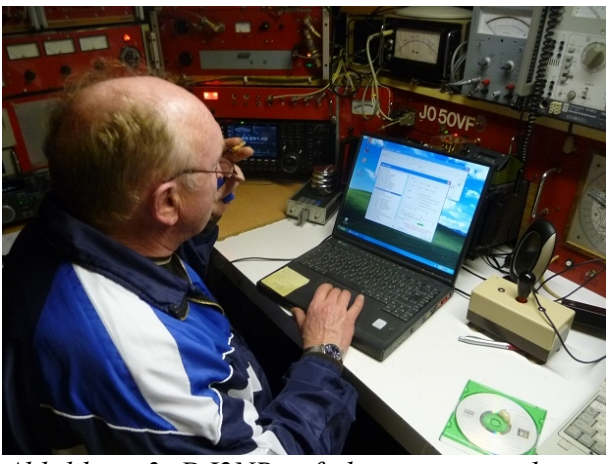
Abbildung 3: DJ2NR is fighting against the UCX-Log