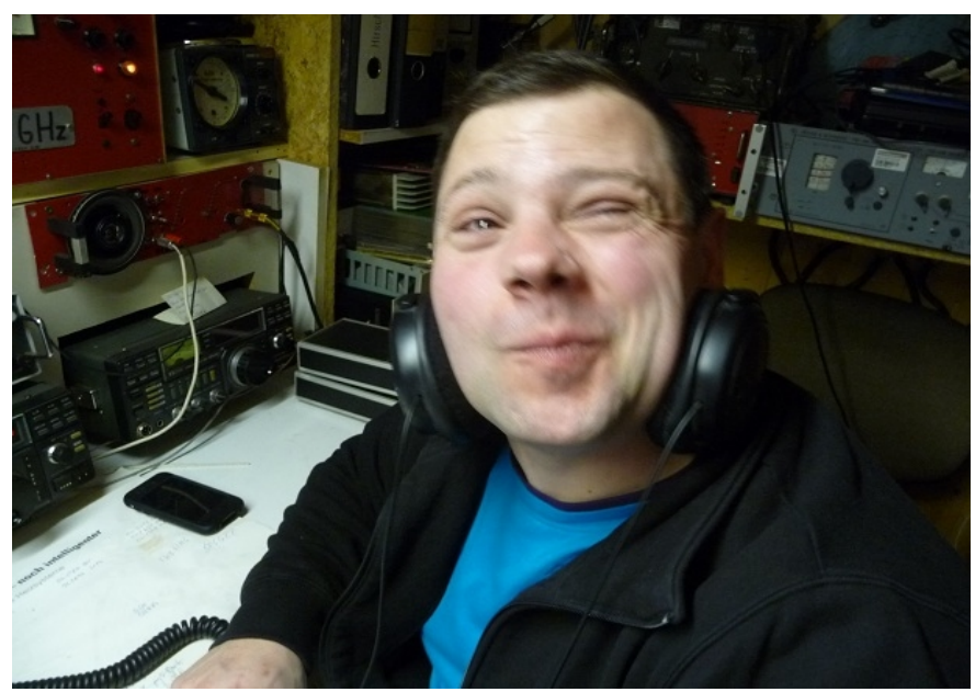
Abbildung 6: really strong signals on 13cm are necessary that thomas can hear them!