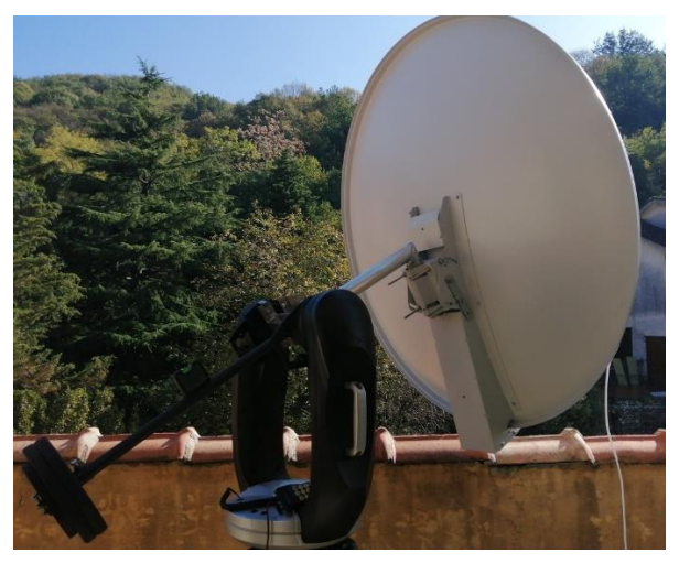
IK1FJI new 1.25 m dish for 3 cm EME

IK1FJI: Valter valter dls@yahoo.it was on for the Oct ARRL Contest WE -- I was QRV 8 hours in the 1st Moon pass on 23 cm; I worked 44 CW stations and found very good conditions. Sometimes, I had 3 stations replay to my CQ, but some were missed because I can replay only to one! I hope to work some more in the Nov leg. Hopefully the weather (WX) will be fine. My rig is a 3.8 m dish with a septum feed/choke, 0.2 dB NF LNA and TH327 PA @1400 W. Meanwhile, I'm working on 3 cm. I have a 125 cm dish with modified LNB with 25 MHz reference on a robust telescope mount with GPS and computerized tracking. I followed the Sun for 90 minutes and found its noise was a constant 9 ~10 dB. Thus, the tracking seems perfect. I am now waiting for the Moon to be at a declination >10 degs and the beacon to be working to perform more testing. I am look for the TX part with good power.